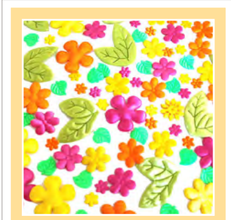
Puffy Shapes Flower 105pk