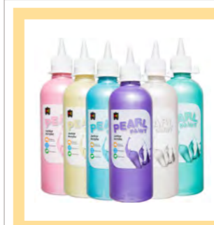
EC Pearl Junior Acrylic Paint 500ml Set of 6