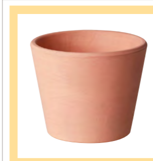
Terracotta Pots - 10pk