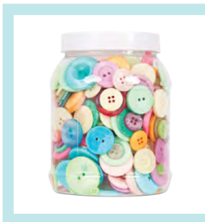
Basic Bulk Buttons 600g - Pastel Colours