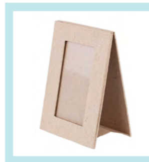
Paper Mache Photo Frame 180 x 240mm 5pk