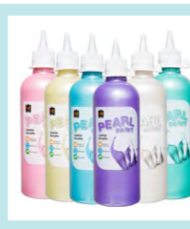
EC Pearl Junior Acrylic Paint 500ml Set of 6