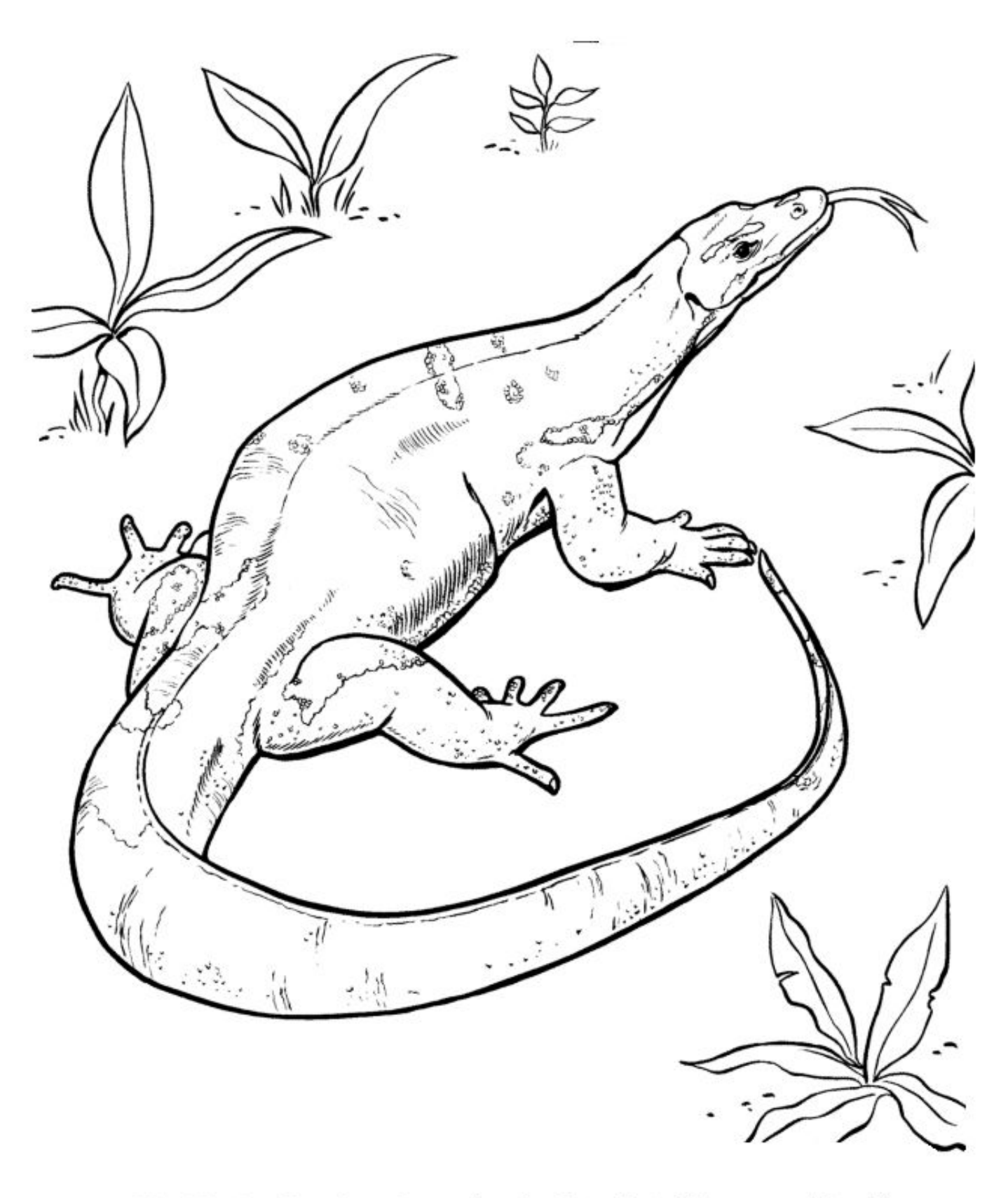
The Monitor Lizard reaches a length of ten feet. Color: greenish with yellow spots.