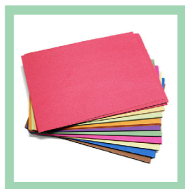
Construction Paper Recycled 100gsm A4 Assorted 120pk