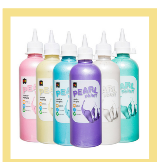
EC Pearl Junior Acrylic Paint 500ml - Set of 6