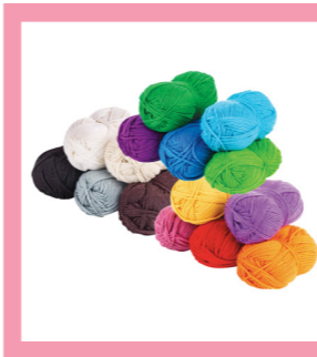
Acrylic Wool Complete Set 15pk