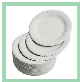
Paper Plates White 50pk - Large