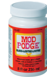
Mod Podge Gloss Varnish Glue 236ml