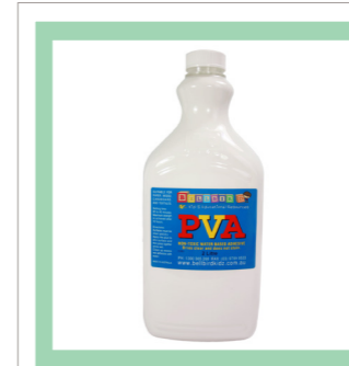
Bellbird PVA - 2L