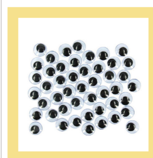
Round Joggle Glue On Eyes 100pk 15mm