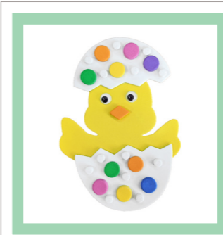
Foam Easter Egg/Chick Kit