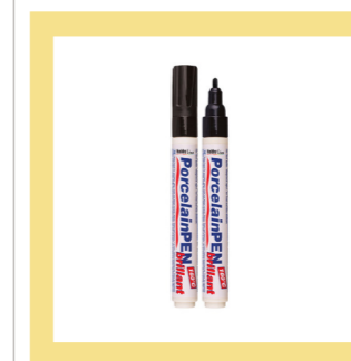
Porcelain/Ceramic Markers - Black Bullet & Fine 6pk