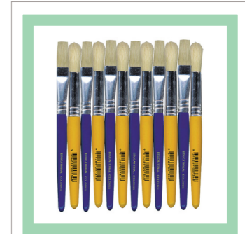
Jumbo Stubby Brush Flat & Round Set of 12