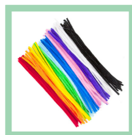
Pipe Cleaners 100pk Assorted Colours 300mm