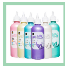
EC Pearl Junior Acrylic Paint 500ml Set of 6