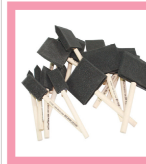
Foam Brushes Class Set of 18