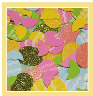
Foam Stickers - Easter Eggs 144pcs