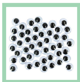
Round Joggle Glue On Eyes 100pk 15mm