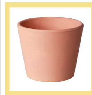
Terracotta Pots - 10pk