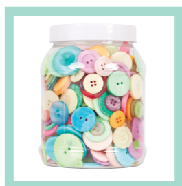
Basic Bulk Buttons 600g - Pastel Colours