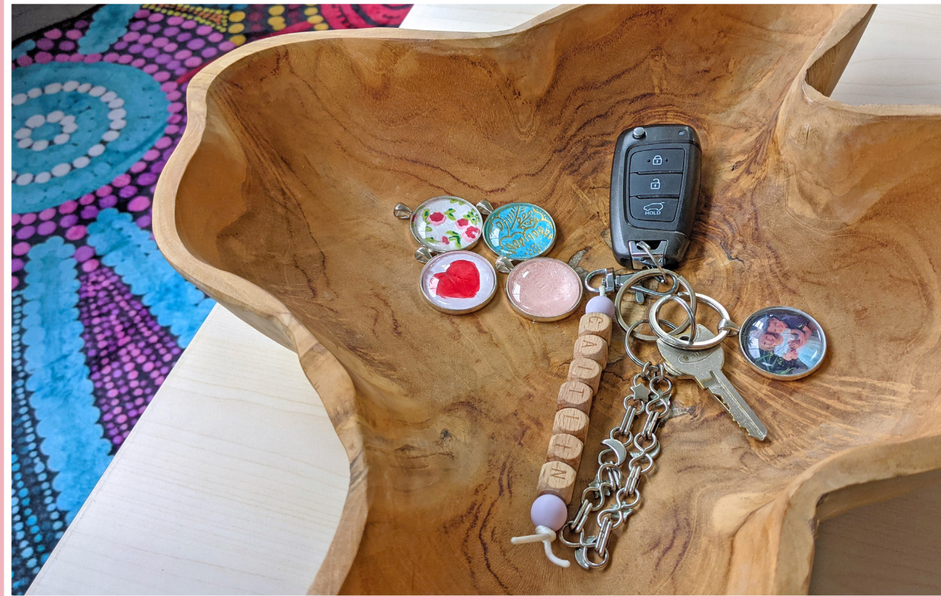
Photo & Art Pendants