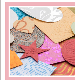
Handmade Collage Paper Shapes - 500g