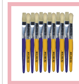
Jumbo Stubby Brush - Flat & Round Set of 12