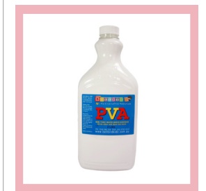
Bellbird PVA - 2L